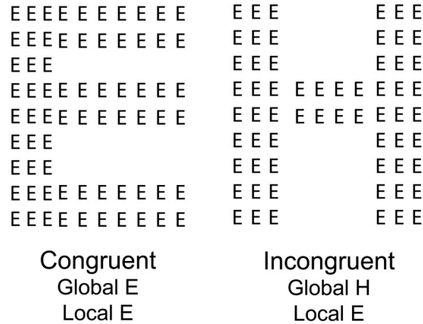
Figure 1. Example of stimuli used in Navon task (Watson, 2013). Participants are faster responding when both the global and the local features match (congruent condition: E made of smaller E's) as opposed to when they don't match (incongruent condition: H made of smaller E's).

tures was again observed by Hommel et al. (2010, Figure 2). Is this attentional outcome because of religious belief?